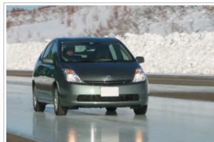
All weather performance testing for vehicle Hydraulics